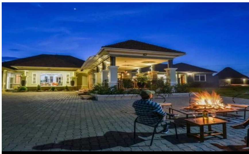
Ishaazi Farm Lodge in Rushere provides luxurious accommodation

Luxurious Options: Kiruhura District may not have many high-end luxury hotels; most of the accommodations in the district are mid-range or budget, with a few luxury lodges near Lake Mburo National Park. It offers a mix of options, especially for those interested in nature, culture, and wildlife, with a variety of good choices for a comfortable stay in the National Park such as Mihingo Lodge, Lake Mburo Safari Lodge, Kigambira Lodge and so many others. Those spending their leisure time, we have Ishaazi Farm Lodge in Rushere Town Council, Mpogo Lodge in Nyakahita, Nyakashashara Sub County, Canon Buningwire Guest House and Texas County Lodge both in Rushere Town Council and quite many more. You can never regret spending your quality time within Kiruhura District.