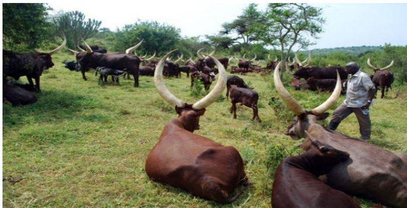
The beautiful Ankole Long-horned cattle