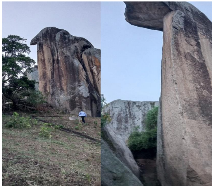
The Beautiful scenery of Mugore Rocks

Mugore Rock: Is a cultural and natural landmark in Kiruhura District that offers insight into the traditions and beauty of the area. While not yet a mainstream tourist destination, it holds great potential for cultural tourism and offers a peaceful retreat for those seeking to experience rural Uganda's landscapes and traditions. Visitors to the district who are interested in the Ankole culture, natural beauty, and historical significance will find Mugore Rock an interesting addition to their itinerary. The rock formation stands out in the landscape of Kiruhura, offering visitors a beautiful view of the surrounding terrain. The district, known for its rolling hills, fertile soil, and cattle farms, provides a stunning backdrop for Mugore Rock. The area around the rock is often lush with green vegetation, making it a tranquil spot for nature walks or simply enjoying the peace and serenity of the environment. For the local communities, Mugore Rock holds symbolic value. It is associated with local spiritual beliefs and might be considered a sacred site. In many African cultures, certain rocks, mountains, or landmarks are believed to be inhabited by spirits or ancestors, and this belief may be present in the local understanding of Mugore Rock.