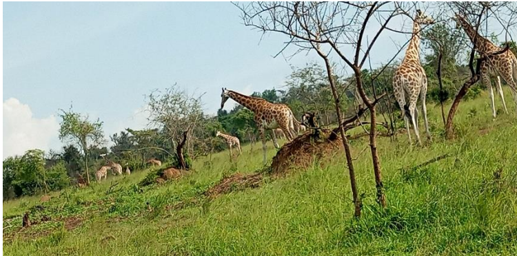
Giraffes are among the best scenes in Lake Mburo NP

experience the park's ecosystem up close and Birdwatching where the park is a home to over 350 species of birds.